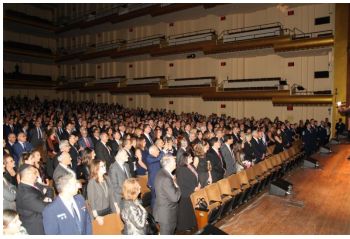
IAJF 15th Annual Gala at David Geffen Hall, Lincoln Center, NY City