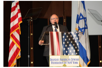
Greeting of Ambassador Dani Dayan, Consul General of Israel in NY