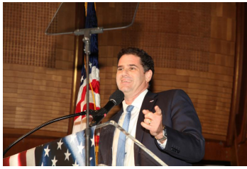
Keynote Speaker, Ambassador Ron Dermer, Israel's Ambassador to the United States