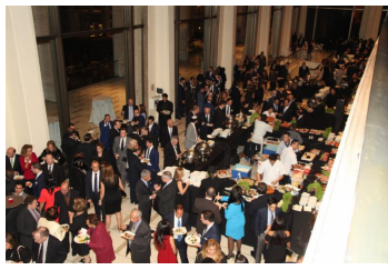
IAJF Gala Reception