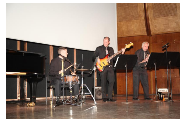
Great Neck Public Schools Show Band in Performance