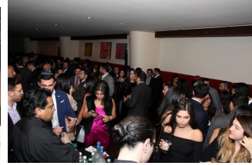
IAJF Young Leadership Gala After Party