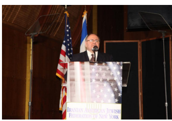
Greeting of Ambassador Dani Dayan, Consul General of Israel in NY