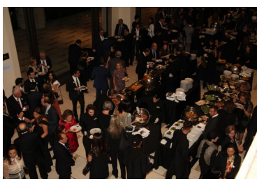
IAJF Gala Reception