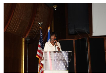
2013 Miss Israel, Titi Ayenew