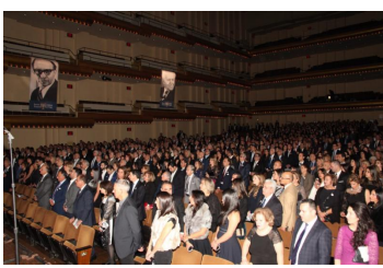
IAJF 17th Annual Gala at David Geffen Hall, Lincoln Center, NY City